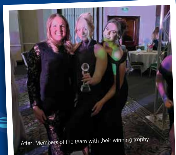
After: Members of the team with their winning trophy.

The black tie event raised £10,000 which will be split between the North Tees children's ward and Nuvo Wellbeing's 'N Dance Academies'. The money raised for the children's ward will be used to transform one of the ward's outdoor areas into a new therapeutic garden for young patients.