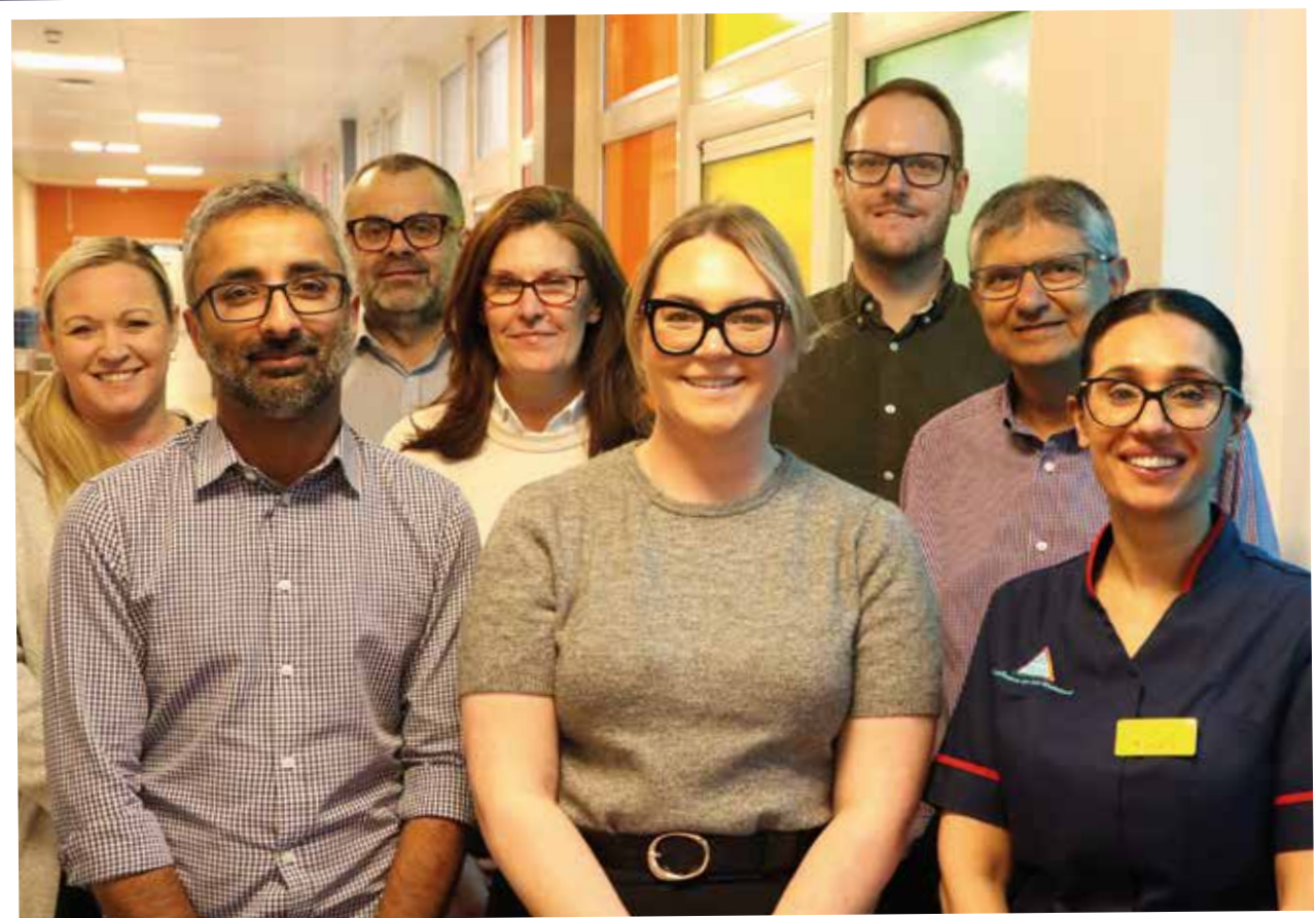
The digital projects team and clinical colleagues at the University Hospital of North Tees.

"It's a true partnership and I am so proud of everyone for this achievement."