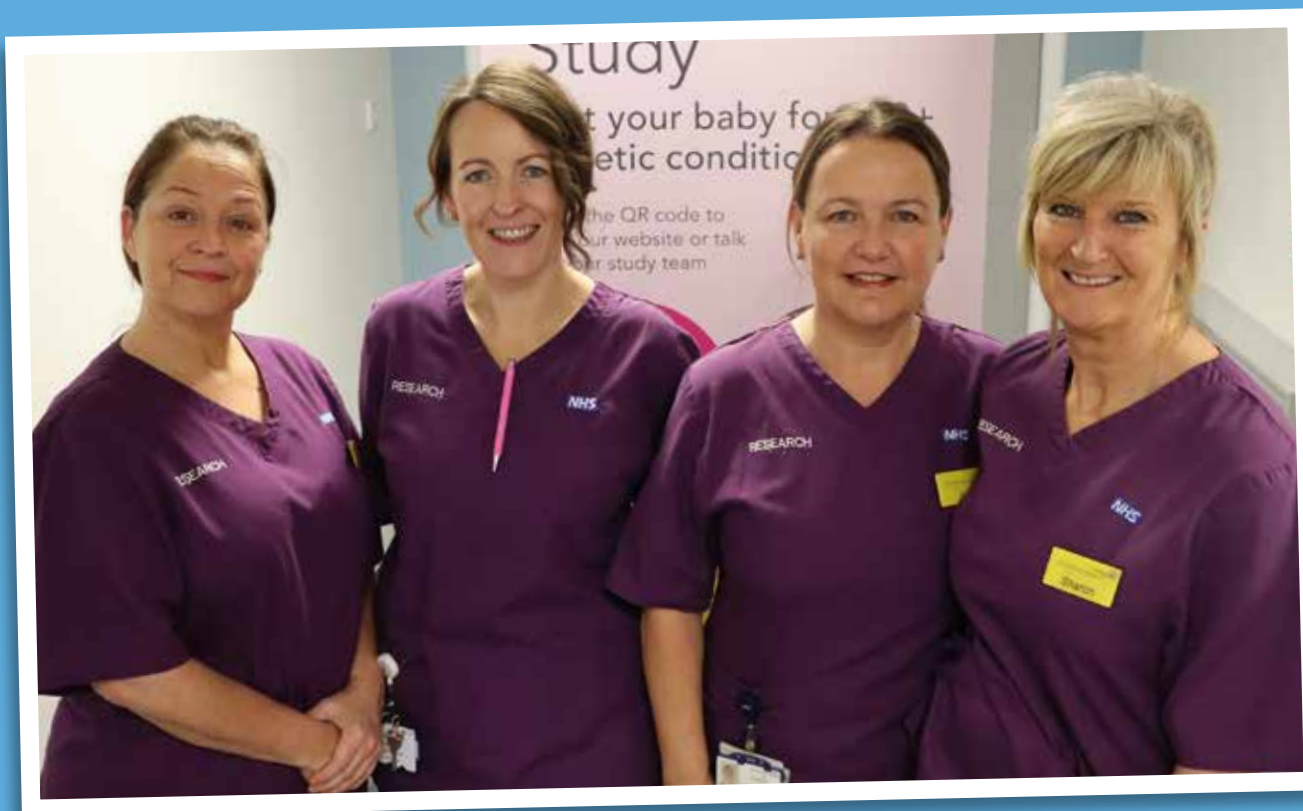
The maternity research team at University Hospital of North Tees.

For more information and to register your interest in the study, visit: www.generationstudy.co.uk