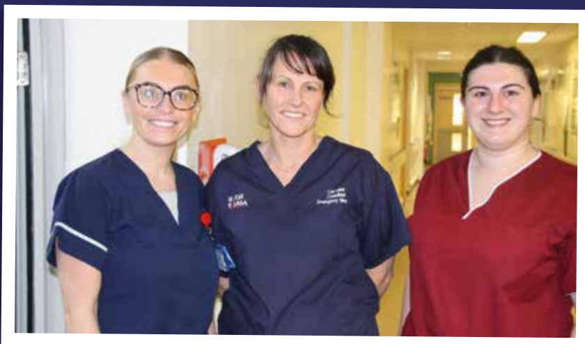
The emergency department team at The James Cook University Hospital.