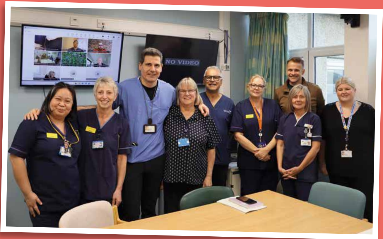
The endoscopy team celebrate their JAG reaccreditation.

A Teesside-based endoscopy service has once again been acknowledged for its 'high standard of achievement' as it celebrates its successful reaccreditation, following a recent annual review.