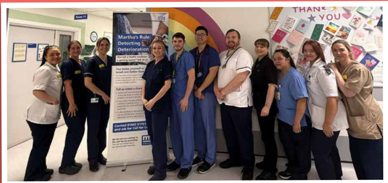
Ward 27 team