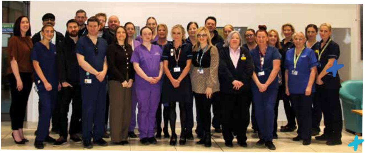
The digital projects team and clinical colleagues at The James Cook University Hospital.