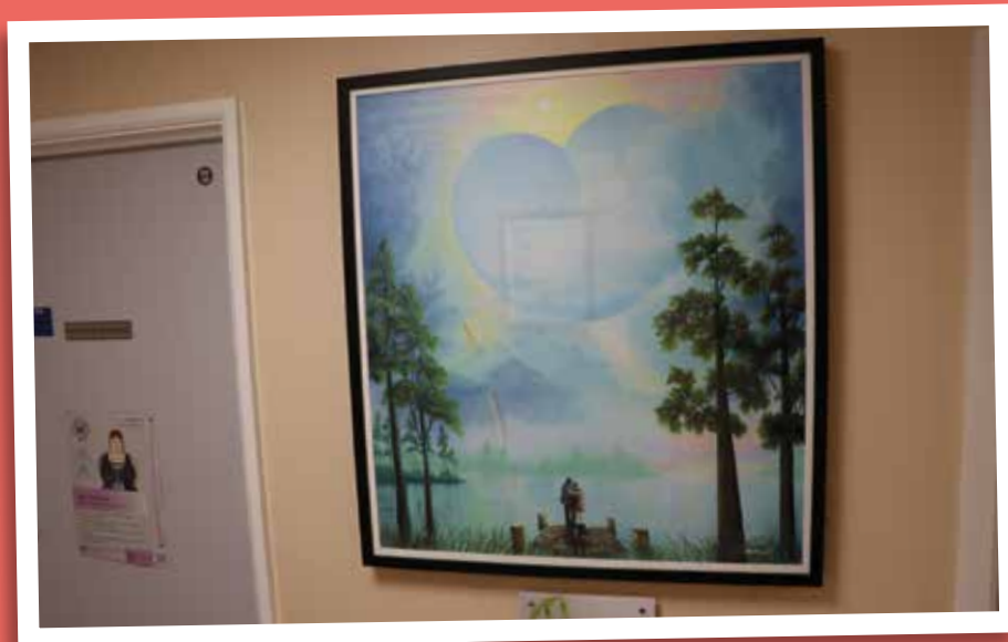
The artwork in situ on the Snowdrop Suite.

"That's ultimately what we wanted - to create something that might lift other families during a time of overwhelming pain, even if only for a moment."