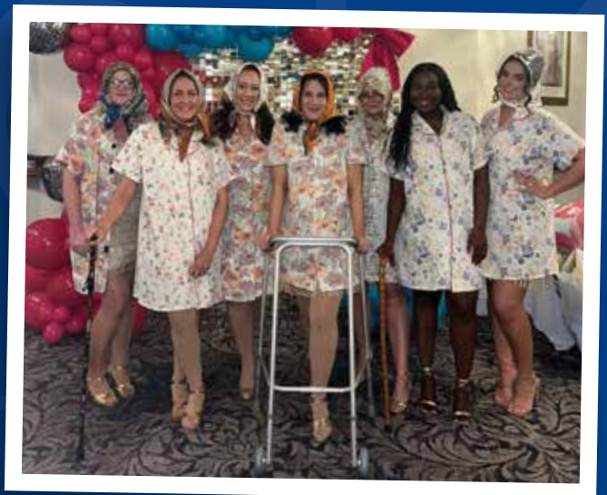
Before: The children's ward dance troupe ready to take to the stage.