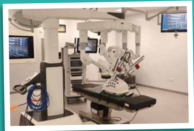
The Da Vinci robot.